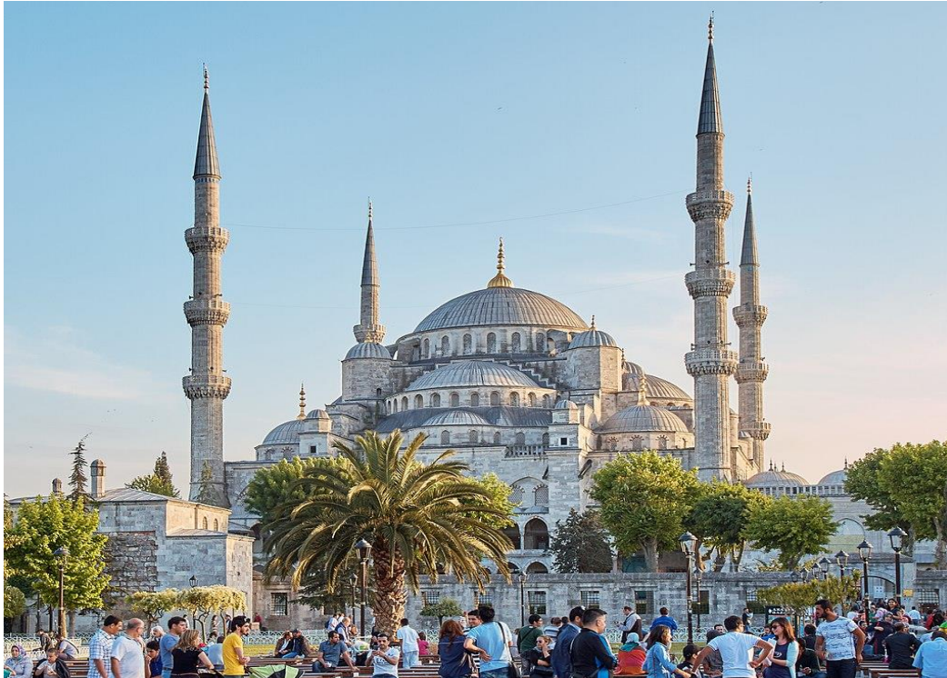
Istanbul- The Blue Mosque