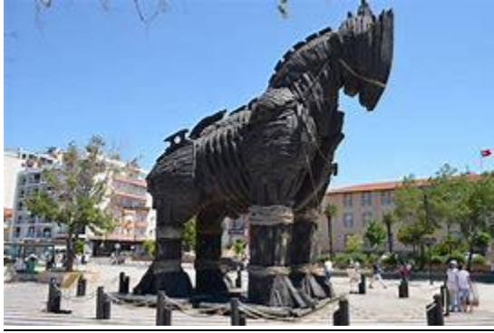
Bergamo Trojan Horse